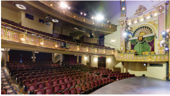
MISSOURI'S OLDEST & LARGEST CIVIC THEATRE

Springfield Little Theatre is a nonprofit, volunteer-driven organization, energized by the highest artistic ideals, that strives to entertain, educate, and involve the community in live theatrical productions and in the preservation of the historic Landers Theatre.