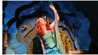
PRODUCED & PERFORMED LOCALLY