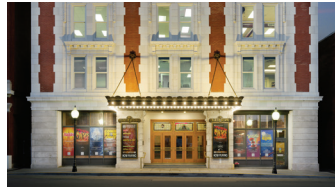
HISTORIC DOWNTOWN HOME